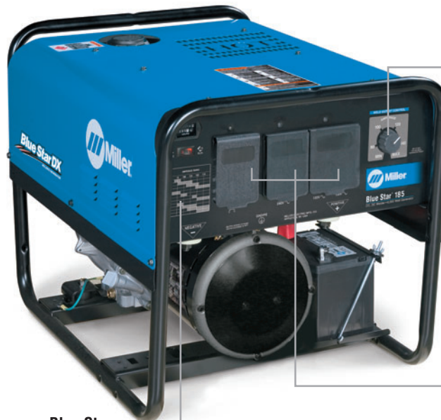
Blue Star 185 DX shown

Quick-reference parameter chart provides convenient amperage setting guidance.